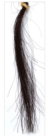
After 27 washes with shampoo and maintenance formula